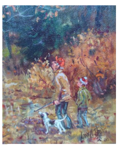
"Crow Days" Original Oil Painting

My favorite memories growing up would have to be either in the woods or on a river bank. My painting "Crow Days" shows my dad and me with our dog walking through the woods on a grey autumn day. Dad said to me "Son, these grey days are called crow days!"