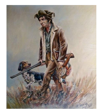
Original Oil Painting A very early selfie that I painted when living in Dallas – Fort Worth, dreaming that I was back in good ole Missoura

a swing set and television set." It was then and there that I decided that we were going to get out of this city life. When we moved back to Missoura and bought a farm, I threw our television set in the pond. I swore that from then on my kids and my grandkids were going to have lots of memories. Thinking back on those years in Dallas / Fort Worth, I can't remember any subject matter in city life that would have made good selfies.