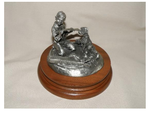
"My Favorite Christmas Present" Pewter Sculpture (Ltd Ed of 750)

I have very fond memories of my first Red Rider Daisy BB Rifle that I received one Christmas. "My Favorite Christmas Present" is a pewter sculpture on me with that rifle. You can see how happy I was to have received this gift.