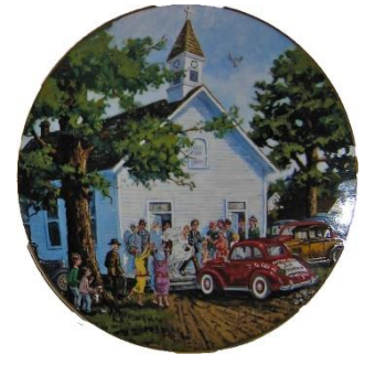
"Country Wedding" Collectors Plate (Ltd Ed of 7,500)

I tried to capture a couple of vignettes of my youth while living in the original town of Red Oak Missoura using several different media.