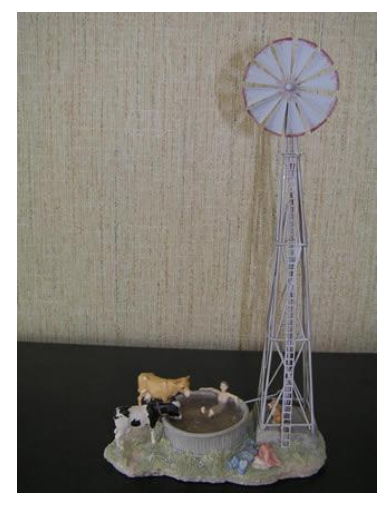
"Long, Hot Summer" Porcelain Figurine (Ltd Ed of 1,950)

After my parents moved to Carthage, the farm was still my love! Luckily I had lots of aunts and uncles who lived on surrounding farms so I tried to spend my summer vacations on their farms. I would spend 3 or 4 days at one aunt's and uncle's farm until they got sick of me and then I would just thank them and go to another aunt's and uncle's farm. "Long, Hot Summer" is a selfie of me using the animals' drinking water tank at one of my relative's farm to cool off.