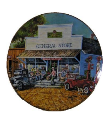
"Red Oak General Store" Collectors Plate (Ltd Ed of 7,500)

During the Second World War, we lived in the rear of the ole General Store in Red Oak. One hot summer afternoon, dog days of summer is what we called such days, a couple of ole timers were sitting on the front porch talking about the war and watching the world pass by. A city slicker pulled up in his shiny red convertible and an ole coon hound crawled out from under the porch, strolled over and took a whiz on his new white wall tires. It didn't take much to entertain us back in those days.