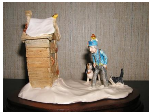
"No Private Time"

My animals seemed to never leave my side and I seemed never to be able to have any private time. This next selfie is a winter scene of me going to the outhouse and really demonstrates that I had “No Private Time”.