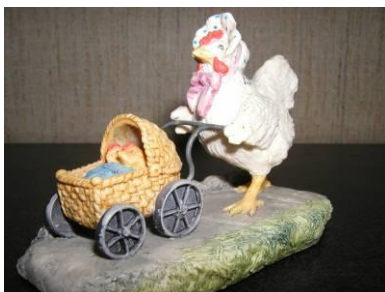
Double Yolker 25516 (1992)