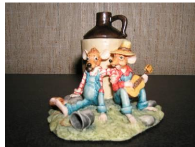
Home Squeezins 25504 (1990)