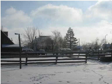
Looking towards the General Store

All the seasons at Red Oak II are very nice and when we get a significant snowfall during the winter, Red Oak II becomes a winter wonderland. Red Oak II resident Judy Knudsen captured the late January 2009 snowfall at Red Oak II in the following photos: