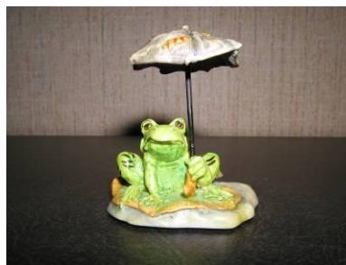
Toad Strangler 25509 (1991)