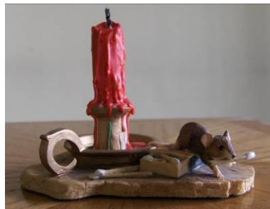
Don't Play with Fire (Red candle)

Some of the other attached pictures are of pieces with rare colors and/or items. For instance, one of my favorites is "Don't Play with Fire" with the RED candle and red, green, and white candle wax in the holder.