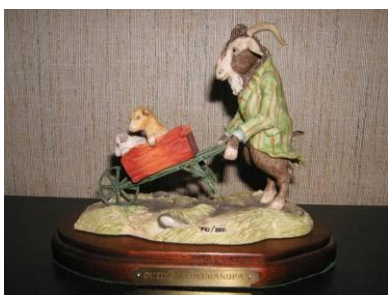
Outing with Grandpa 25502 - Ltd Ed 2,500 (1990)