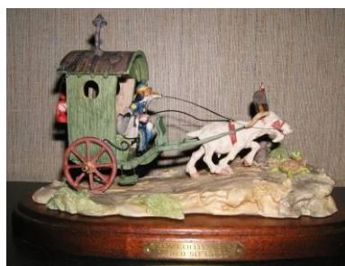
When Coffee Never Tasted So Good 25507 - Ltd Ed 1,250 (1991)