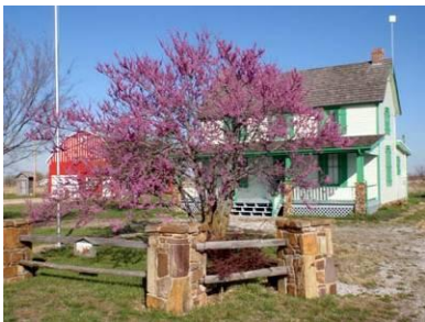
Red Bud tree at Civil War House

The red buds are a sure sign that spring is in the air at Red Oak II.