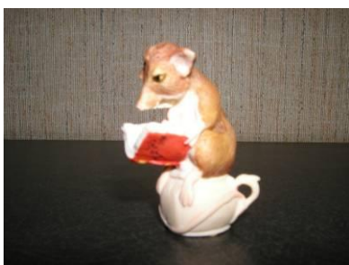
Private Time 25506 (1990)