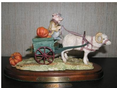
Punkin' Pig 25505 - Ltd Ed 2,500 (1990)