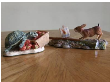
Strawberry Patch & Counting the Days