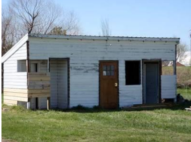
Salem Church Privy under renovation

II. The privies behind the Salem Church are being renovated for those visitors.