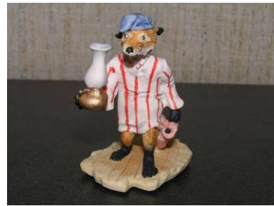
Hittin' the Sack 25510 (1991)