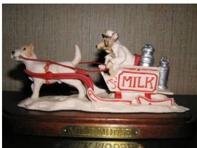
Milk Mouse 25503 - Ltd Ed 2500 (1991)