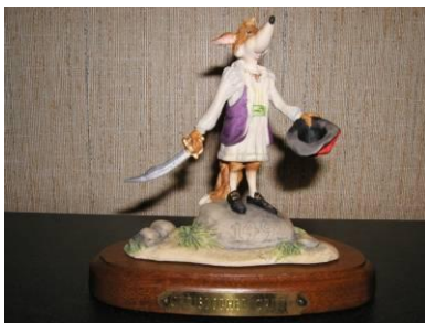
Christopher Critter 25514 - Ltd Ed 1,192 (1991)