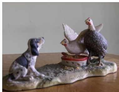
Freeloaders (white, black and brown dog)

Most of the pieces I have seen just have the white candle and wax. "Freeloaders" has the dog with more intricate coloring than just the plain brown.