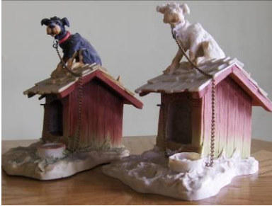
Long Days, Cold Nights versions

half painted!! I don't know where this piece came from or why it is not completed, but it looks interesting next to my full-color piece!