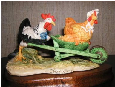
Charivari 25707 - Ltd Ed 950 (1992)