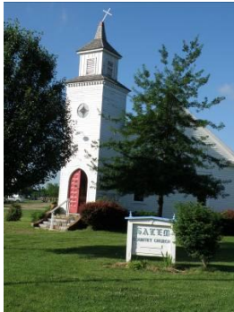
Salem Church with crooked cross

Folks always ask if the cross on the top of the church is meant to be crooked.