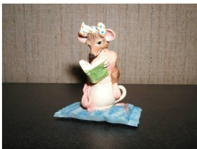
Miss Private Time 25517 (1992)