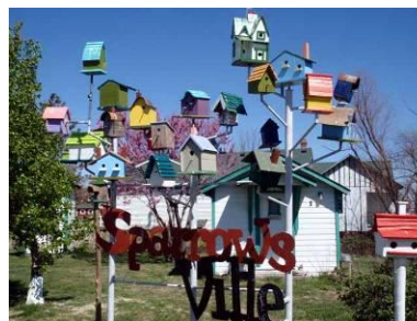
Lowell's Sparrows Ville, Red Oak II

I even built Sparrows Ville for my little feathered friends, the sparrows.