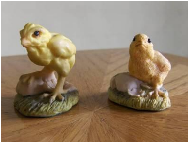
New Day (left) and Brand New Day (right)

I am also proud to own both "New Day" (which was changed due to production problems) and "Brand New Day".