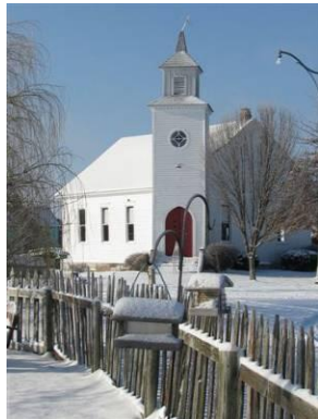
The Salem Church