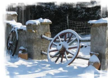
Wagon wheels and fence in snow