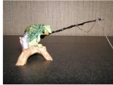
Gittin' A Nibble 25294 (1989)