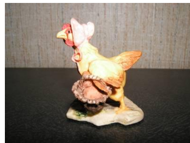
Itiskit, Itasket 25511 (1991)