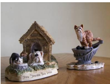
You Snooze, You Lose & Grandpa's Ole Tom