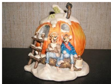
Punkin' Wine 25501 (1991)