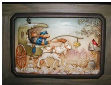
When Coffee Never Tasted So Good Music Box 809225 - Ltd Ed 1,250 (1991)