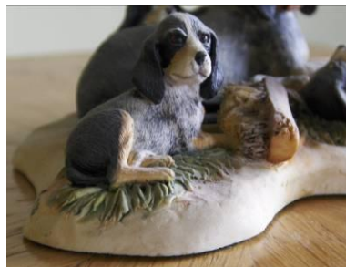
Oh Where is he Now? (with brush)

"Oh Where is he Now?" was a "special" limited-limited edition that included a brush on the ground.