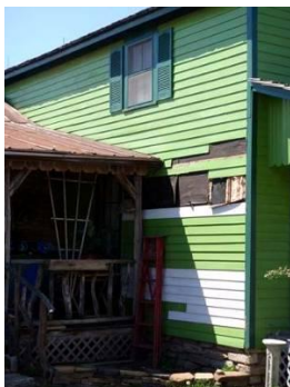
Belle Starr House under renovation