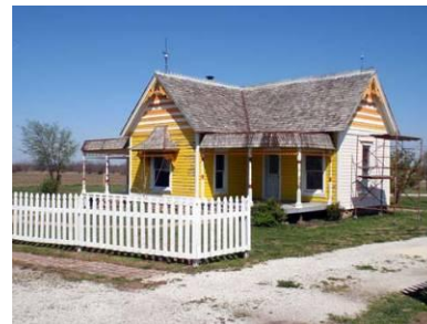
School Marm's House under renovation

Renovation of the interior of the School Marm's house has been completed and work is underway on the exterior, stripping off the old paint, repairing rotted areas and applying a primer coat of white paint.