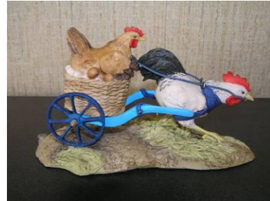
Great American Chicken Race 25500 - Ltd Ed 2,500 (1991)