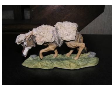
A Wolf in Sheep's Clothing 25518 (1992)