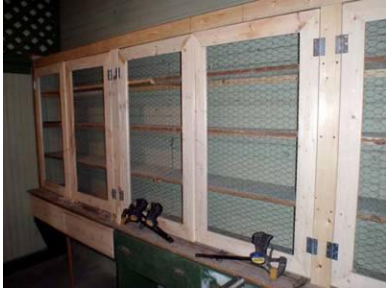
New doors for display shelving in General Store

Lowell's figurines and bronzes. To keep with the theme of Red Oak II, Lowell designed the doors with wire chicken fencing instead of glass or Plexiglas.