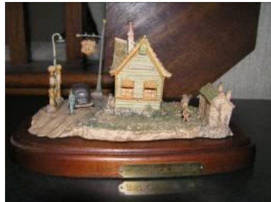
Just Check the Air