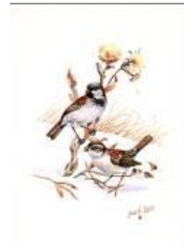
B2 English Sparrow