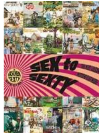
Cover of new Taschen Sex to Sixty book