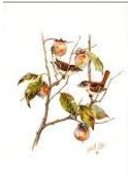
B8 House Wren