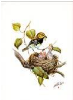
B7 Black-throated Green Warbler