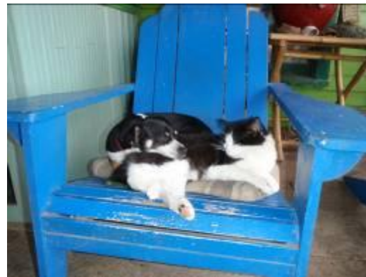
Best of Friends Oggie (left) and Geisha (right)