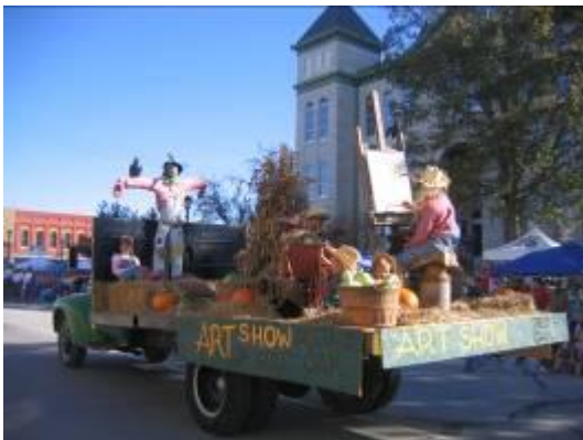
Red Oak II float in the 2007 Carthage Maple Leaf Parade

Carthage Missouri is known as America's Maple Leaf City and every October holds a week long Maple Leaf Festival. One of the highlights of the festival is the Maple Leaf Parade which in 2007 was held on Saturday, October 20. There were over 200 entries in the parade including one from Red Oak II advertising the art show at Red Oak II that afternoon.