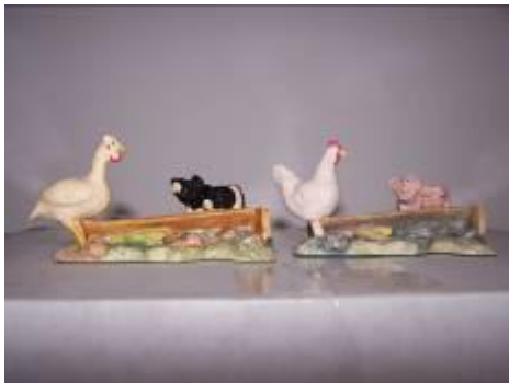
Two variations of "Two's Company"