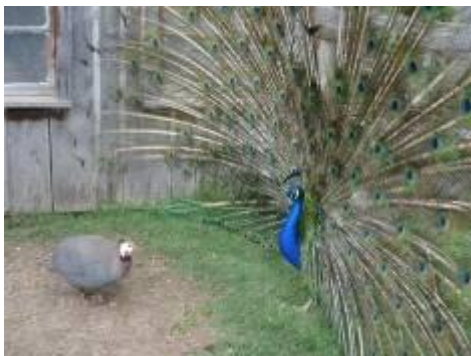
"What do you mean you're not impressed?"