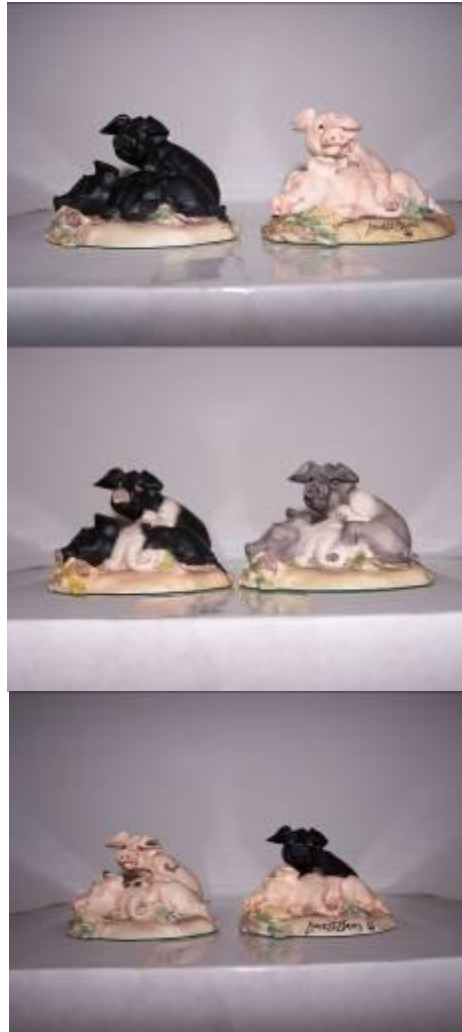
Six variations of "The Orphans"