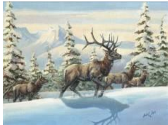
Monarch of the Western Slope (1972)