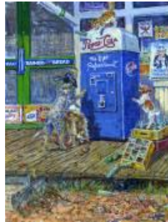
A Dull Day at Red Oak (2007)