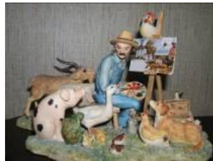
The Critics (1983)