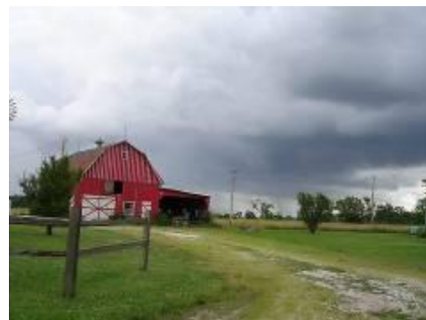
Storm abrewing over Red Oak II