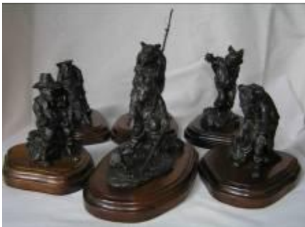
Uncle Remus bronzes

You can see all of the bronzes that we acquired on our Red Oak II Missouri web site: www.redoakiimissouri.com .