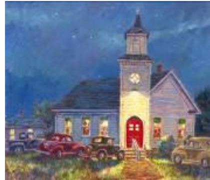
Wednesday Night Service (2007)