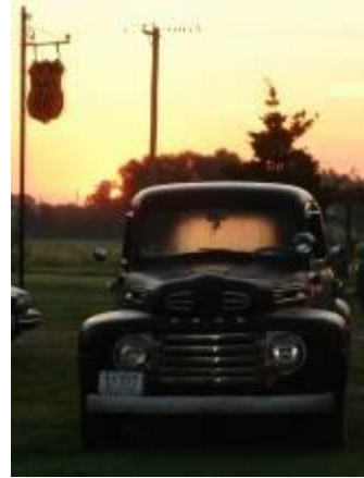
Emery at Sunrise