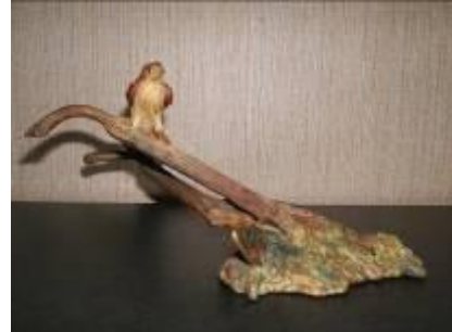
Broken Dreams (1979)