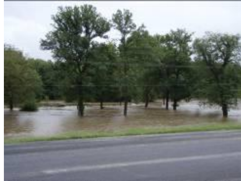
Flooding of the Spring River by Kellogg Lake, 9/8/07

flooding of the Spring River by Kellogg Lake, northeast of Carthage, Missouri.