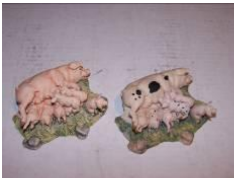
Two variations of "Rooted Out"