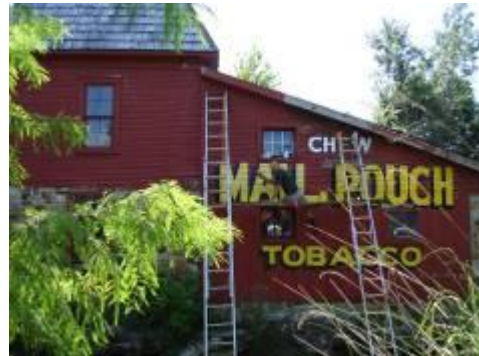
The Birdsong gets a Face Lift © Patty Shanks