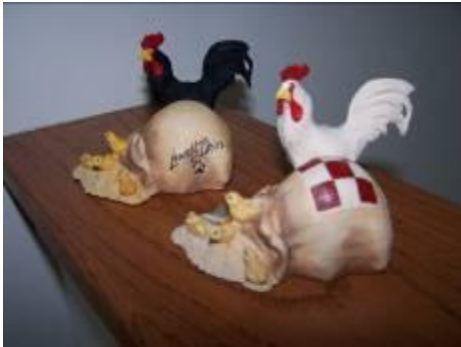
Two variations of "Chow Time"