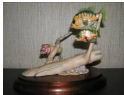
Punkin' Seeds (1981)