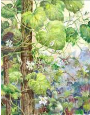
The Hummer (2007)

Giclée prints of these paintings are available from the Red Oak II General Store.