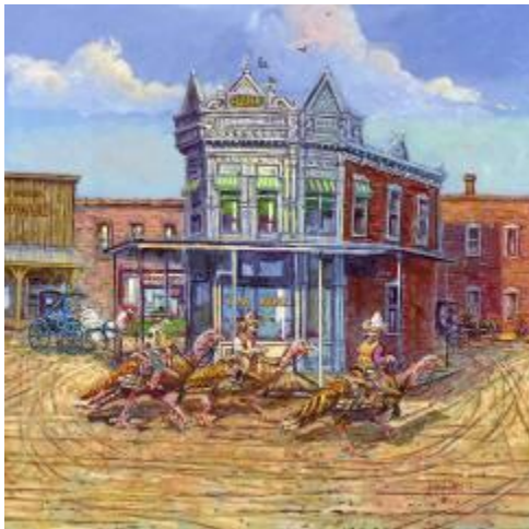
“A Piece of Cake”