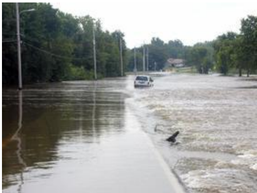
Monday, July 2, 2007

After the very hard winter as described in the previous issue of this newsletter, the spring in South West Missouri has been extremely wet. We had 14 ¼ inches of rainfall in the Carthage area in June. The heaviest rainfalls came June 1 & 2, June 11 & 12 and June 29 to July 1. The following are a couple of photos from the Carthage Press, Monday, July 2 showing the flooding in the area as a result of all the June 29 to July 1 rainfall.