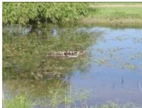
Canada Geese Goslings on Otis' Pond