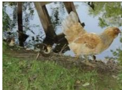
Chicken hen with her "adopted" ducklings beside Remus Pond