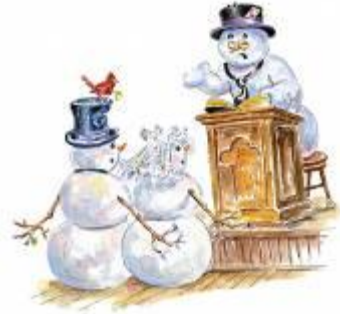
Snow Folks Wedding