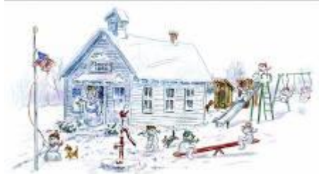
Snow Kids at School