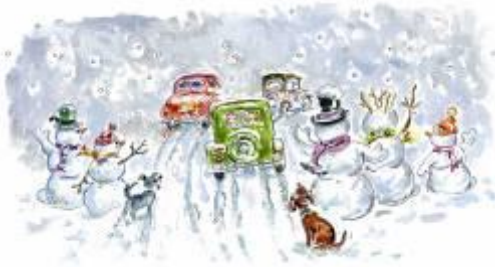
Snow Folks saying Goodbye to Last of the Tourists