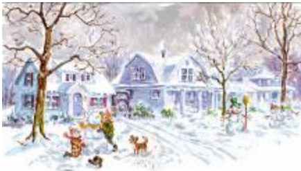
Kids building a Snow Person