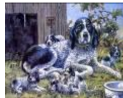
Oh Where is He Now?