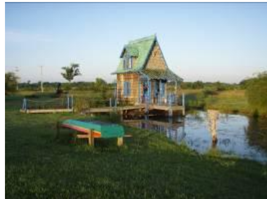
Otis Cabin and Pond, June 9, 2007

At Red Oak II, all this rain has hampered the renovation work on the Black Hen restaurant. However, on a positive note the ponds are all full after being almost completely dried out last year and the trees and lawns are such a lush green as can be seen below.