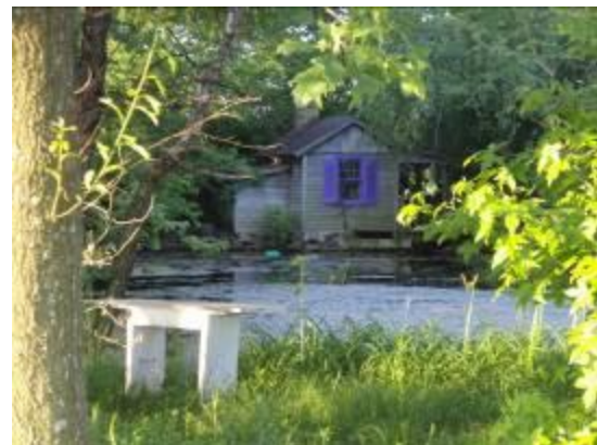
Remus Cabin and Pond, June 9, 2007