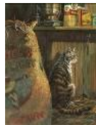
In a Pickle