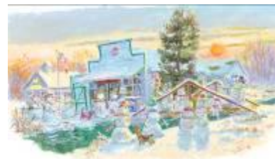
Snow Folks at Creek at end of Winter