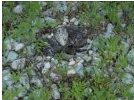
Killdeer chicks in nest on driveway

One of the sure signs of spring is all the young members of the bird families that share Red Oak II with the people and dogs as shown in the below photos taken in early June: