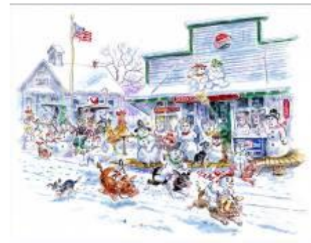
Snow Folks Pig Races