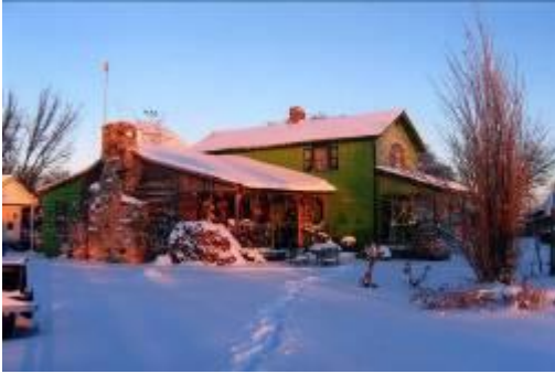
Belle Star House after December 1, 2006 snowstorm

through South West Missouri, Red Oak II received a couple of inches of rain followed by 1" of ice and about a foot of snow.