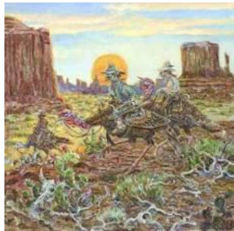
“Eluding the Posse”